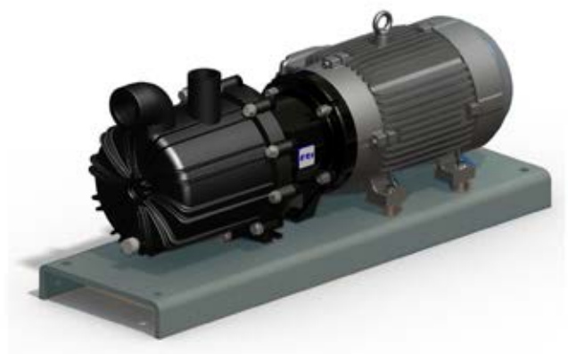
SP10V with FRP baseplate